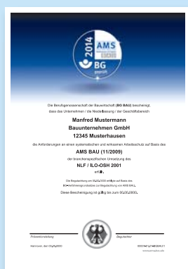
AMS BAU certificate